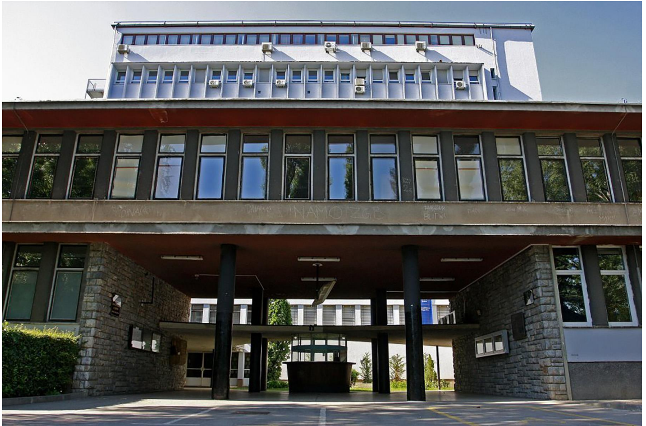
The University of Zagreb, Faculty of Graphic Arts