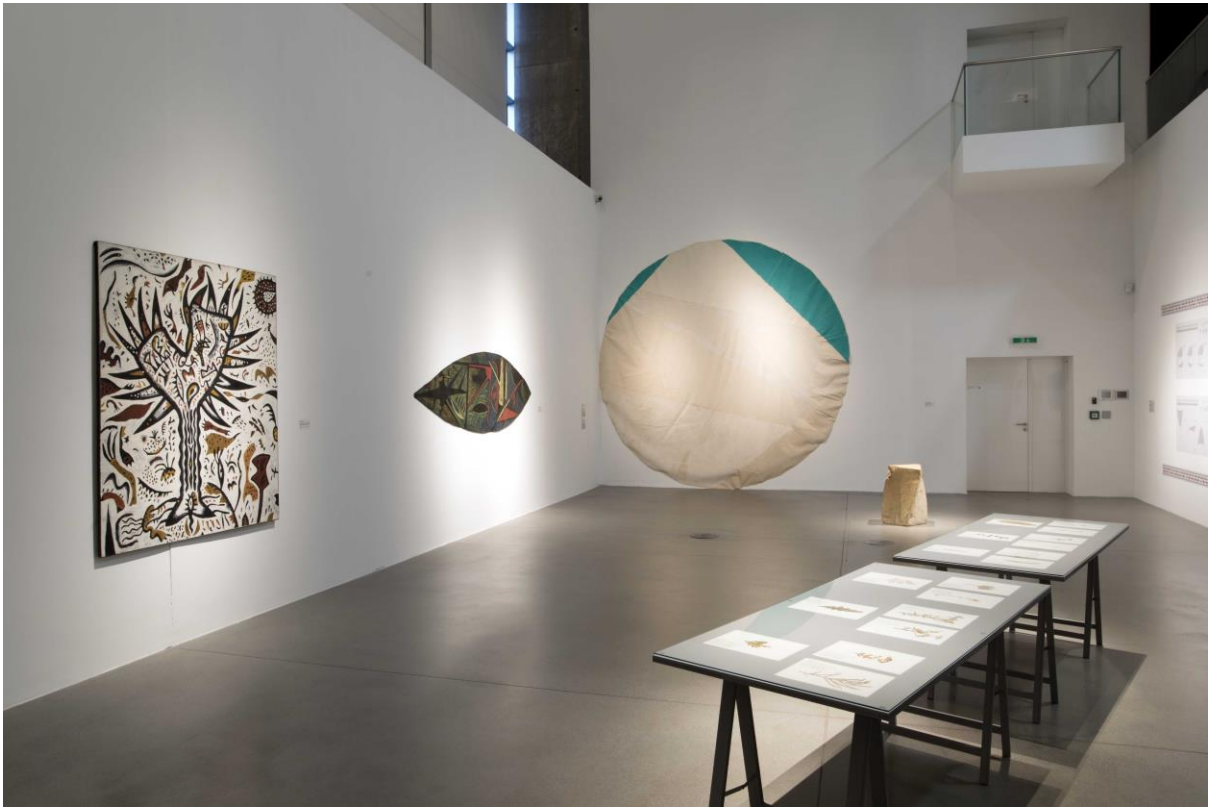
Permanent exhibition of the Museum of Contemporary Art