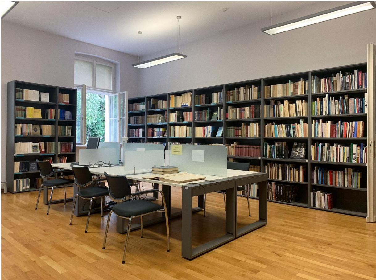
The reading room of the Library of the Croatian Academy of Sciences and Arts