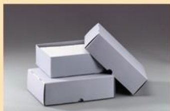
Arhivske trajne kutije i mape Veliki izbor modela i veličina

CRESCAT d.o.o. materijali i oprema za restauratore, arhive, muzeje, knjižnice i privatne zbirke.