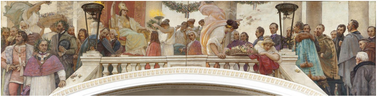
Vlaho Bukovac, The Development of Croatian Culture , 1913