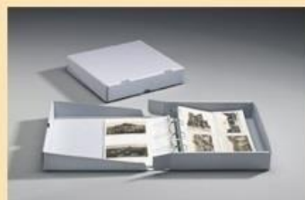
Zaštita za fotografije i negitive