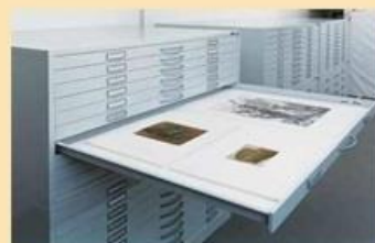
Arhivski ladičari i ormari

Detaljniji pregled naše ponude možete vidjeti na www.crescat.hr