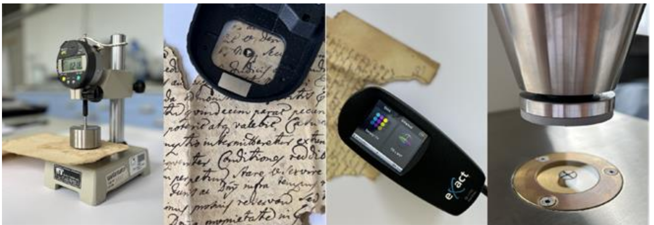
The University of Zagreb, Faculty of Graphic Arts, Laboratory for Graphic Materials