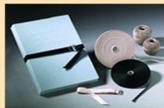
Razni restauratorski i konzervatorski materijali