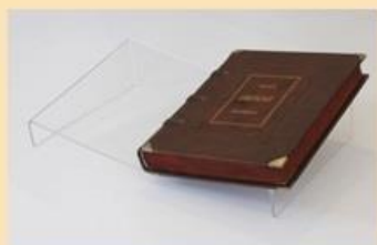
Materijali i oprema za knjižnice