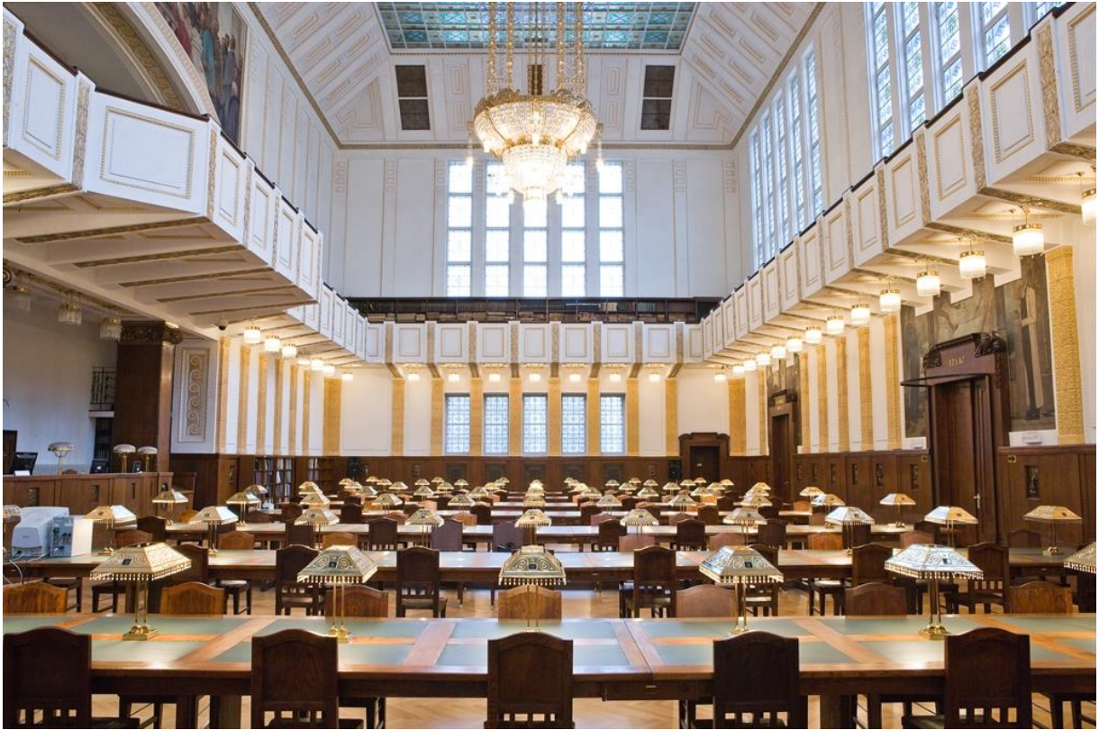
The reading room of the Croatian State Archives