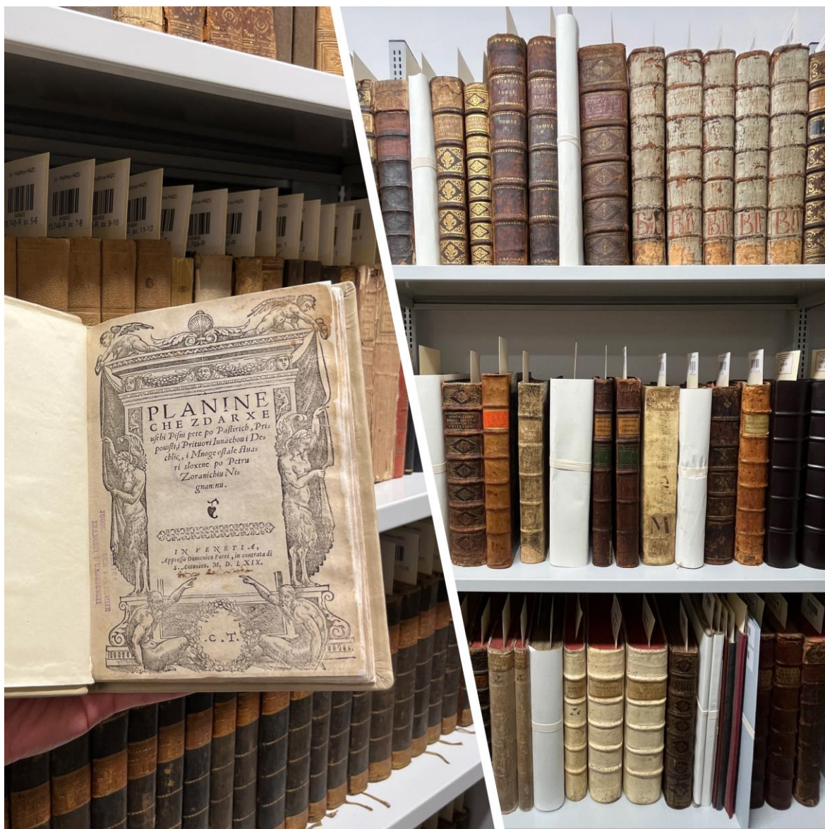
First edition of the novel Planine by Petar Zoranić, Library of the Croatian Academy of Sciences and Arts