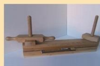
Knjigoveški materijali i oprema