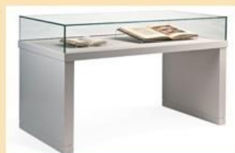
Muzejske vitrine i izložbeni stalci