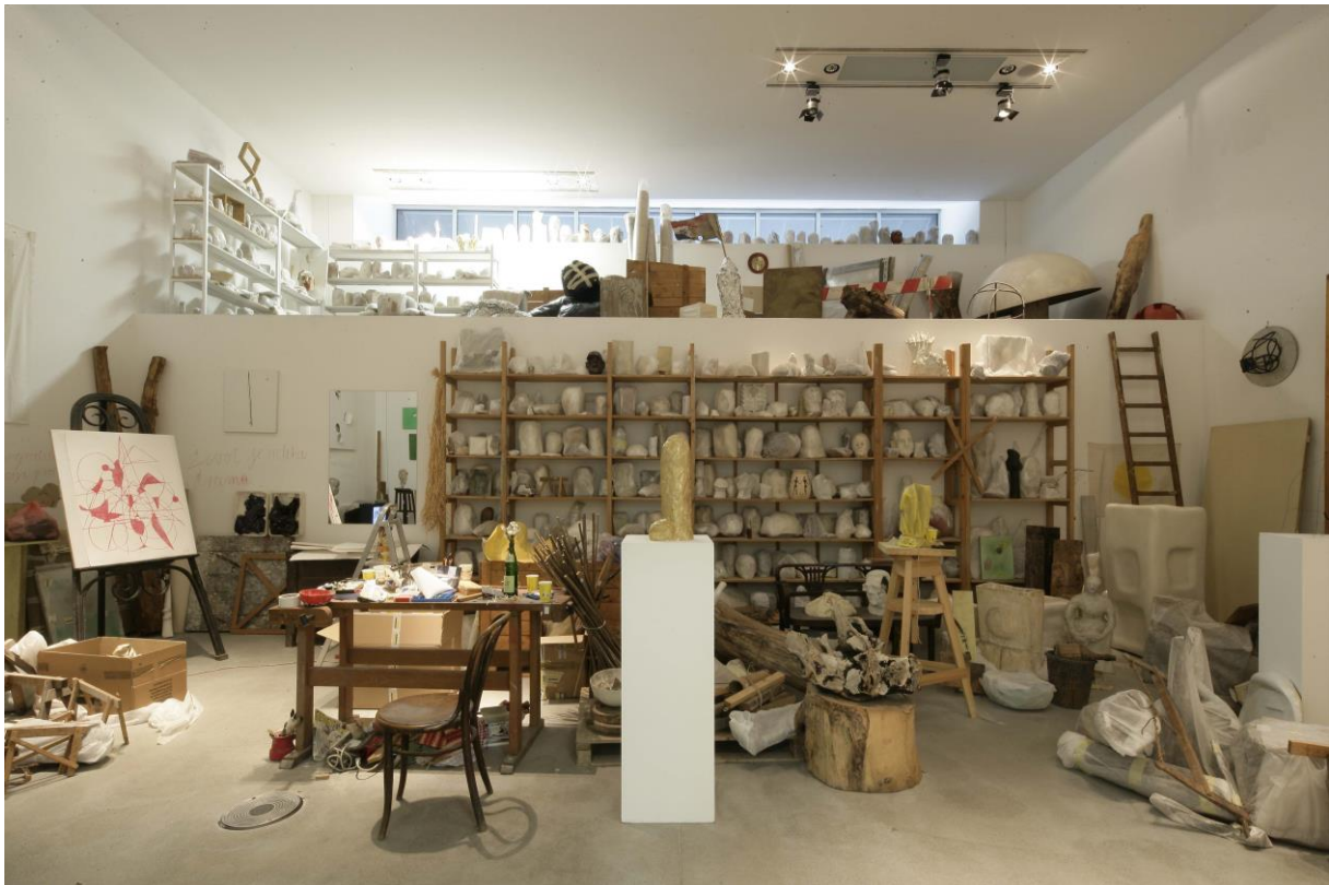
The Museum of Contemporary Art, Atelier Kožarić