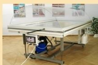
Veliki izbor materijala i opreme za restauriranje papira i tekstila